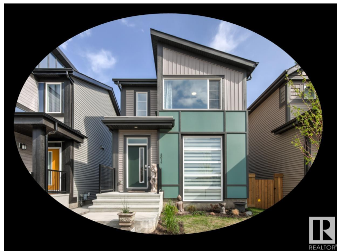
2017 Desrochers Dr SW, Edmonton, AB

Main Floor Exterior Area 742.44 sq ft Interior Area 616.08 sq ft Excluded Area 63.87 sq ft