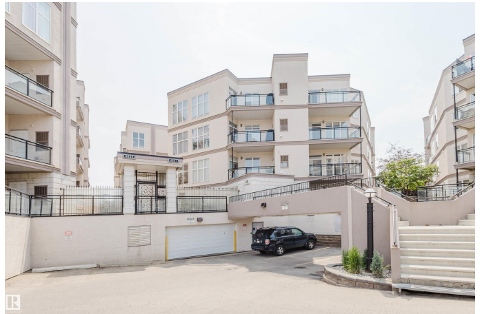
223-4831 104a St NW, Edmonton, AB